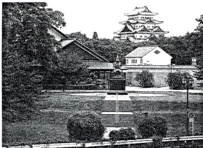
Left: Meijo Substation under a park on Nagoya, Japan; Right: Devonshire Square Substation, London; Below: The base of 7 World Trade Center is a substation in disguise.